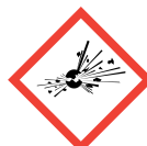
GHS01 (Exploding Bomb)

Signal word : Warning Hazard pictograms :